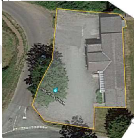
Approx. 0.25 acre for illustrative purposes only